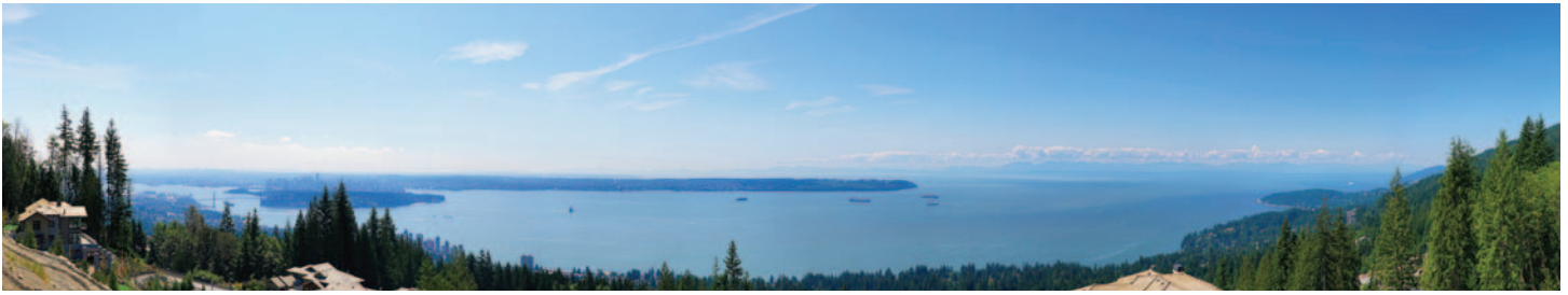
VIEW FROM UNIT C LEVEL 4 WEST BUILDING